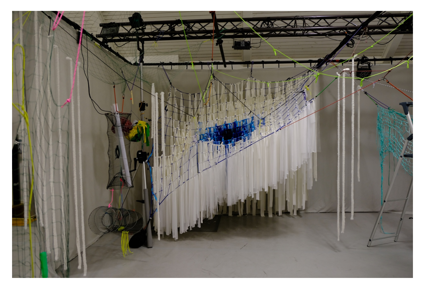
Example of scenography and pipe grid.